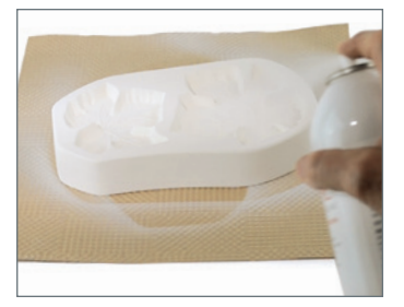
7. Keep rotating and spraying until you have applied MO-RE from all four directions. When finished, allow the mold to dry for 10-15 minutes.