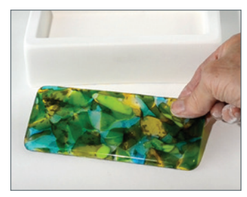
4. When finished, allow the mold to dry for 10-15 minutes.