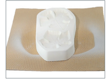
6. Rotate the mold 90° and spray again in swift sweeping motions from side to side.