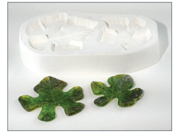
8. Repeat the entire process until you have coated the mold twice from all four directions. The mold is ready to use when it is thoroughly dry.