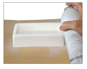
3. Apply ONLY ONE application of MO-RE in all four directions.