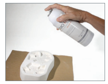
4. Hold the can of MO-RE at a 45° angle, 10-14 inches (25-35 cm) from the mold.