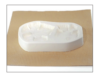
1. Set the mold on a protected, flat surface in a well ventilated area to shield from over spray.

This basic method of application works for ceramic (slumping or frit casting) molds, as well as all types of stainless steel molds.