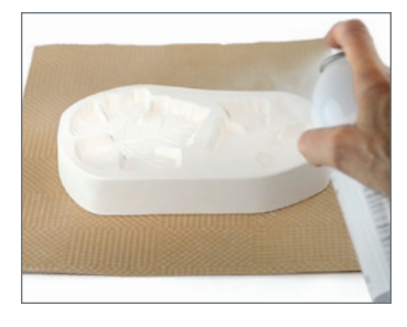
5. Spray in swift, sweeping motions from outside edge to outside edge.