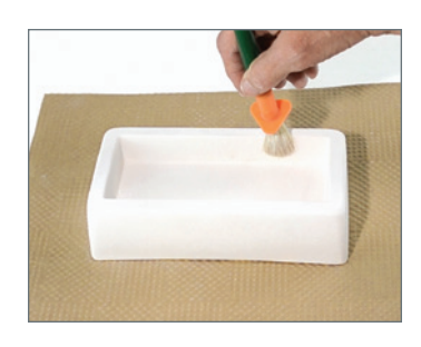
1. Using a nylon brush, gently sweep any loose powder from the cavity of the mold.

You should always remove any loose powder residue between uses of a casting mold since this can potentially mix with the frit of the next project. After cleaning, re-coat with a single application of MO-RE in all four directions.