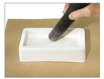
2. Vacuum the dust with your studio Shop Vac. (NOTE: A HEPA filter is always recommended when vacuuming fine particles.)