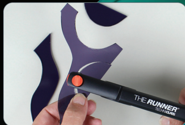
RUN SCORES ON INTRICATE SHAPES

You can use THE RUNNER ® to run long narrow strips, make perfect circles, run deep inside curves, and easily create a split-ring donut shape.