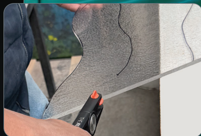
IMPRESSIVELY RUN 1/4" (6 MM) THICK GLASS